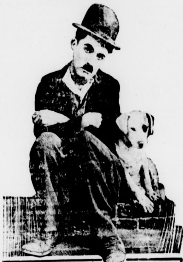
CHARLIE CHAPLIN IN "A DOGS LIFE" HIS FIRST MILLION DOLLAR PICTURE